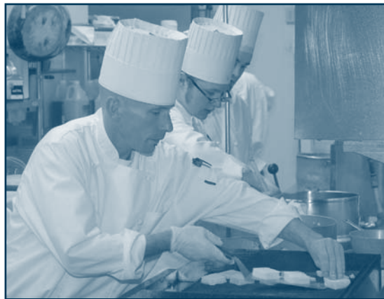
Culinary students practice skills learned in the classroom as they prepare weekly public luncheons.

Last year COCC worked with a curriculum consultant, Michael Carmel, to help identify possible directions for the instructional program. Staff is now working on how best to implement the proposed changes and plan to institute some as early as fall 2009. Once the new $6 million building is completed, COCC will begin offering expanded instruction in baking and will become a national