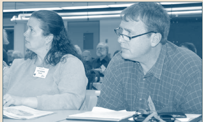
Participants at the Foreign Policy Association's Great Decisions program gain a better understanding of significant world issues.