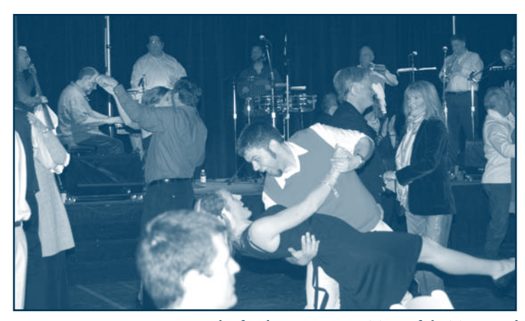
Festivities at the fundraising events, Taste of the Town and Meal of the Year, include dancing to the music of the High Street Band.

On March 5 and 6, the COCC Foundation will present the 35th Annual Meal of the Year to raise funds for scholarship programs and activities. One of the oldest charity galas in the area, Meal of the Year and Taste of the Town are annual fundraising events held on the COCC campus.