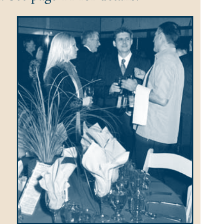
Meal of the Year events bring locals together to support COCC students.

Saturday evening guests are served a gourmet dinner prepared by the High Desert Chapter of the American Culinary Federation in collaboration with the COCC culinary program. Live and silent auctions of donated items highlight the events. Information: 541.383.7225.