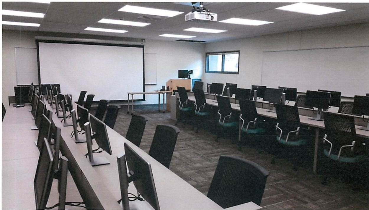
Computer Installation – Ochoco, Computer Lab 142