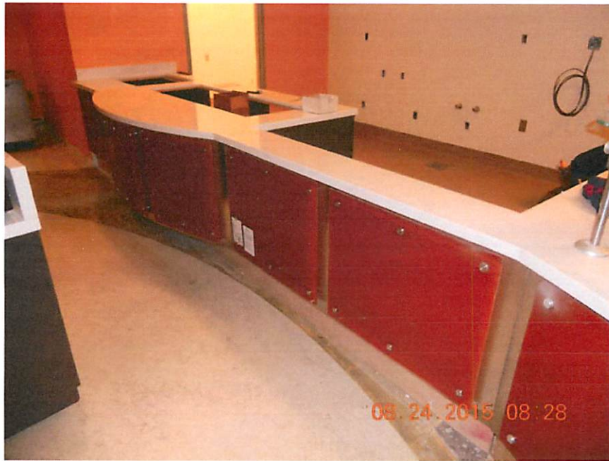
New Servery Stations