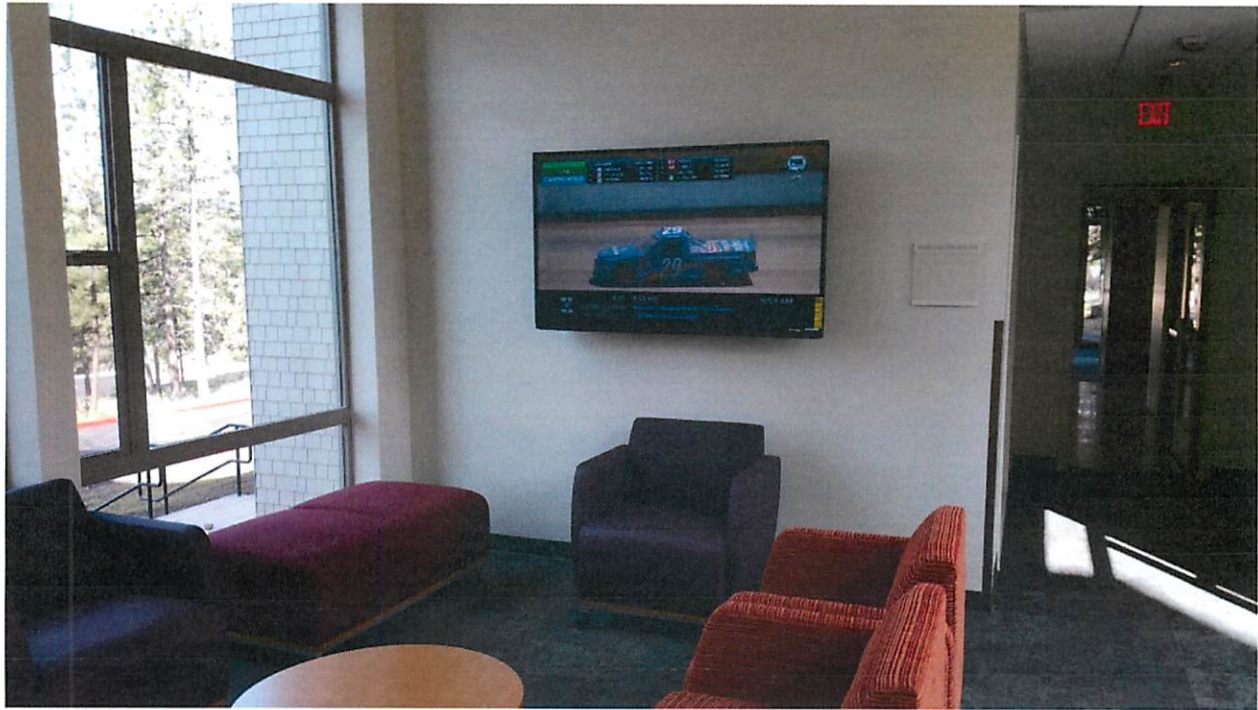
BendBroadband Installation Complete – Residence Hall, Lower Bar