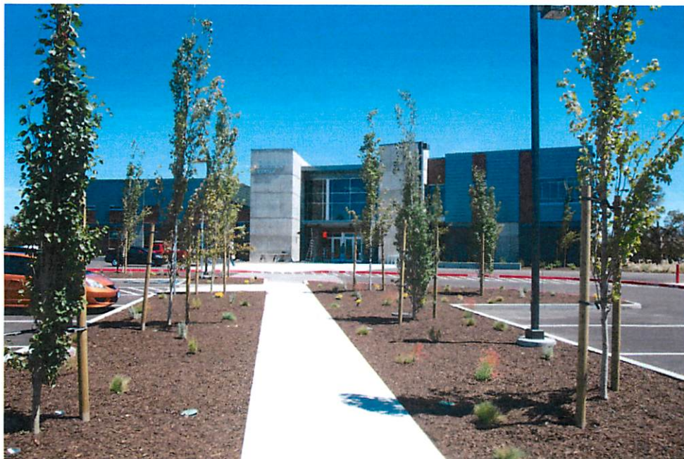
Front Entry from Parking Lot