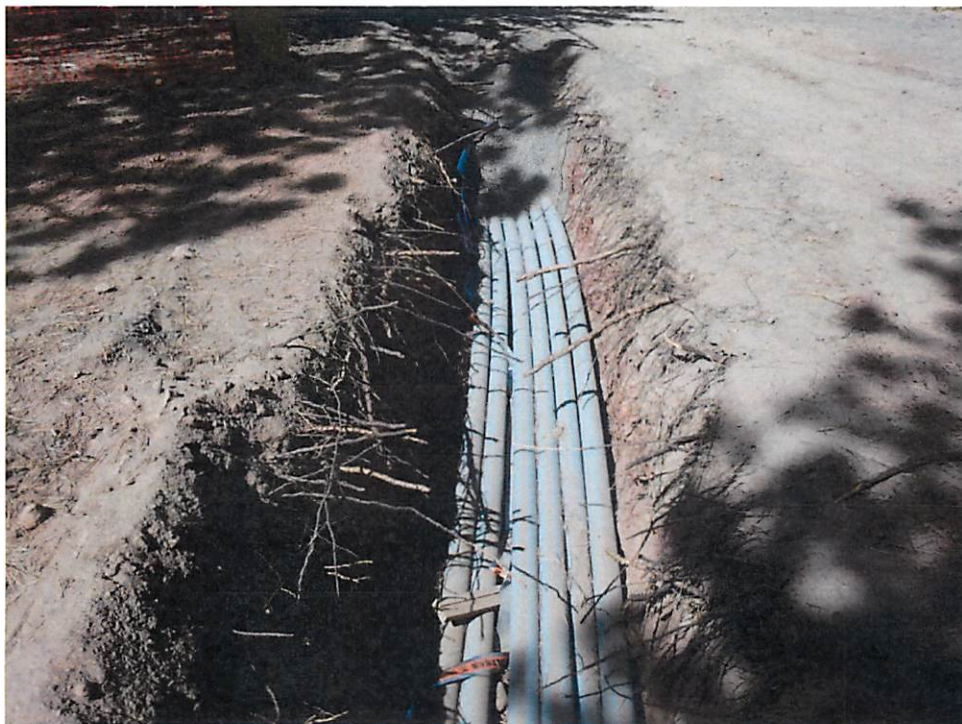
Communications Conduit – Between Backbone Pull Boxes