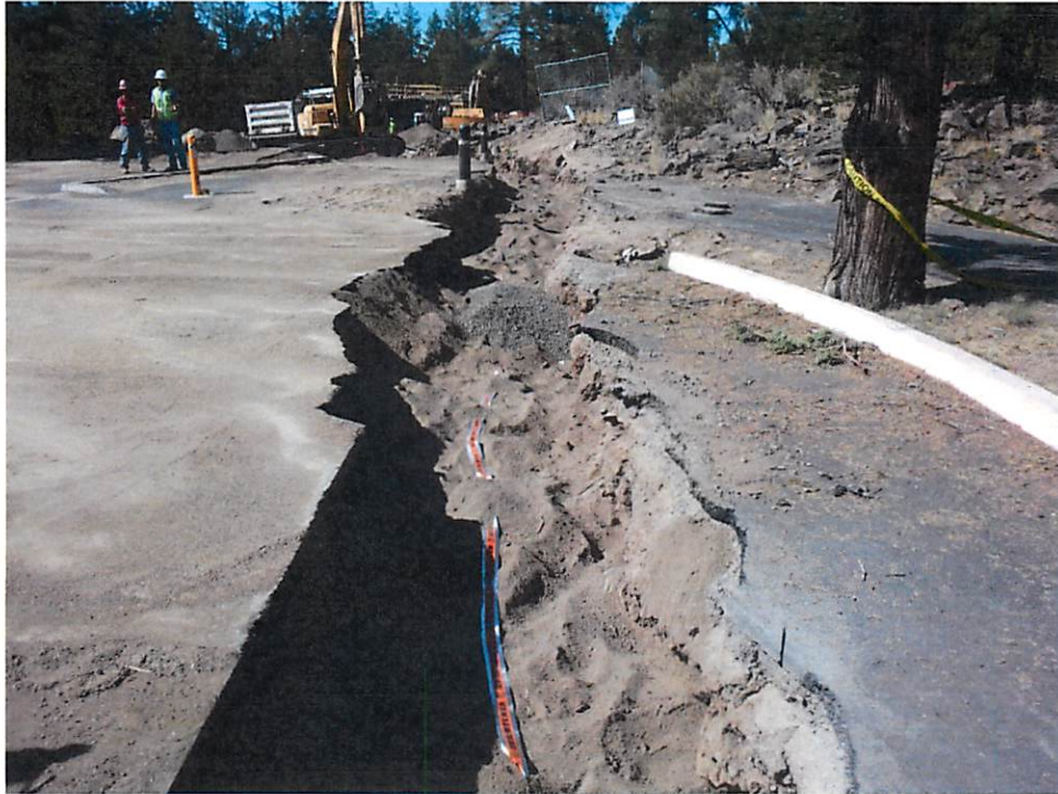
Communications Trench – Connection to Existing Vault at Tennis Courts.