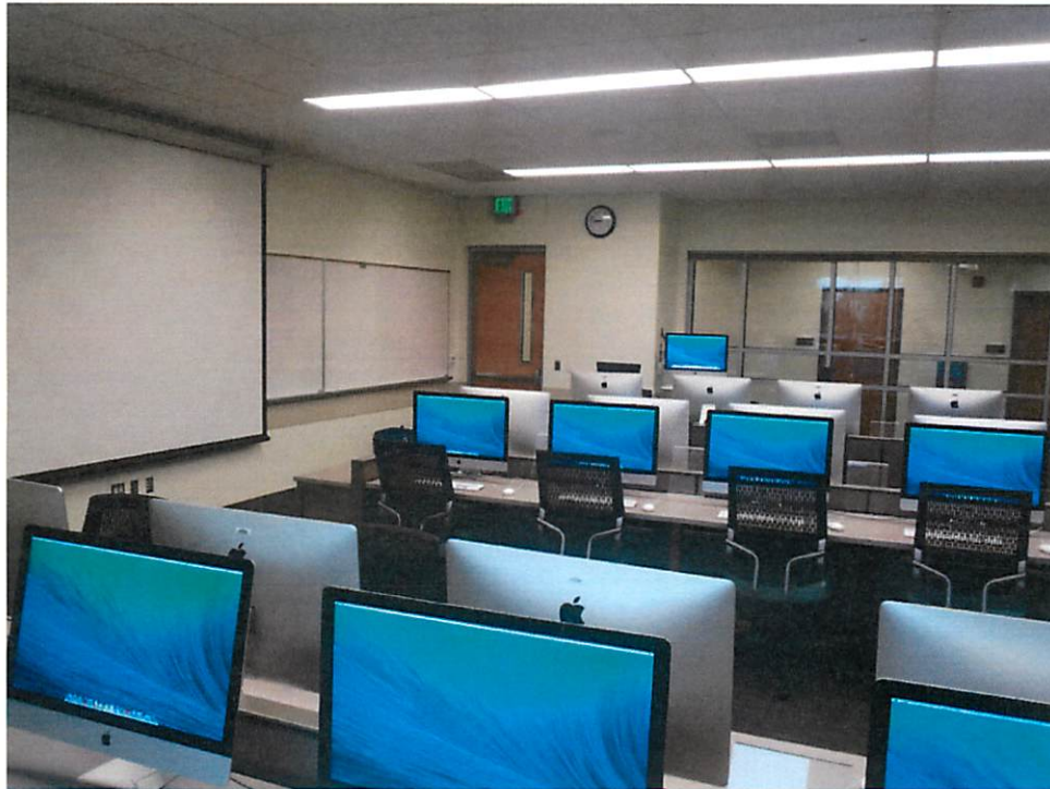
Apple iMac Installation – Computer Classroom 135