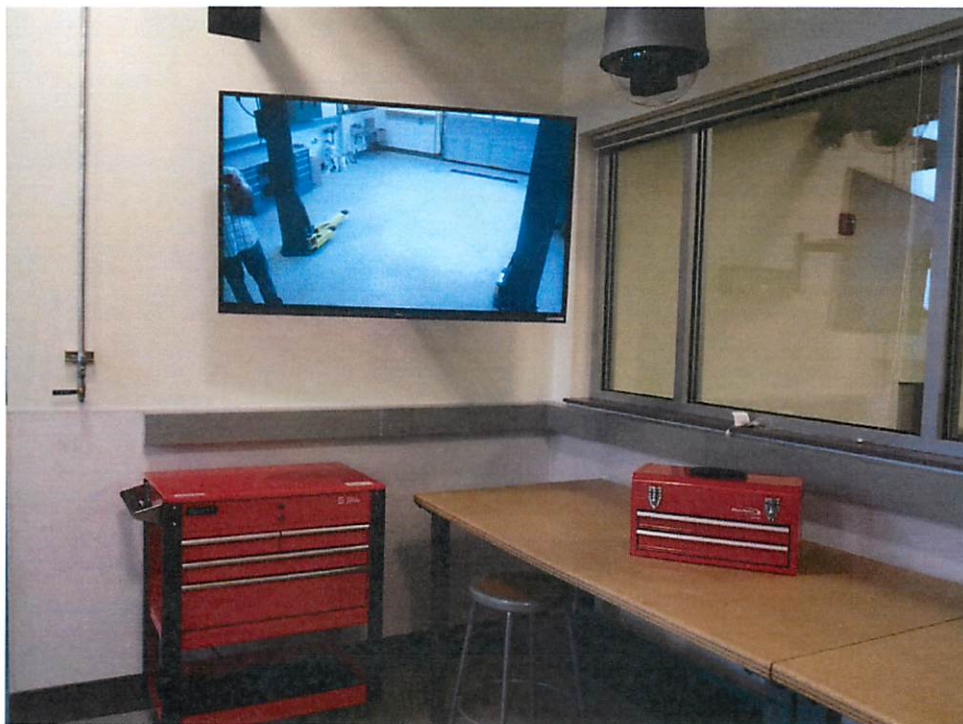
AV Installation – Automotive Lab 117