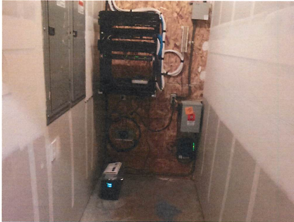
Network Equipment Upgrade – MDF (Network Closet)